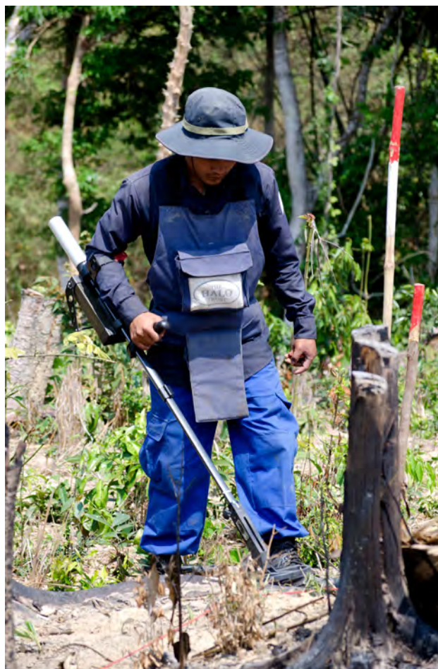
A technician isolates a signal on a clearance task located within Nonsomphou Village boundaries.

HALO's Community Outreach and Risk Education (CORE) team conducted targeted RE sessions, with separate sessions for age and gender specific groups. These sessions often provide additional information about contamination within a village and contribute to the picture built up through thorough non-technical survey. In 2014, HALO conducted 127 RE sessions, educating 7,598 beneficiaries.