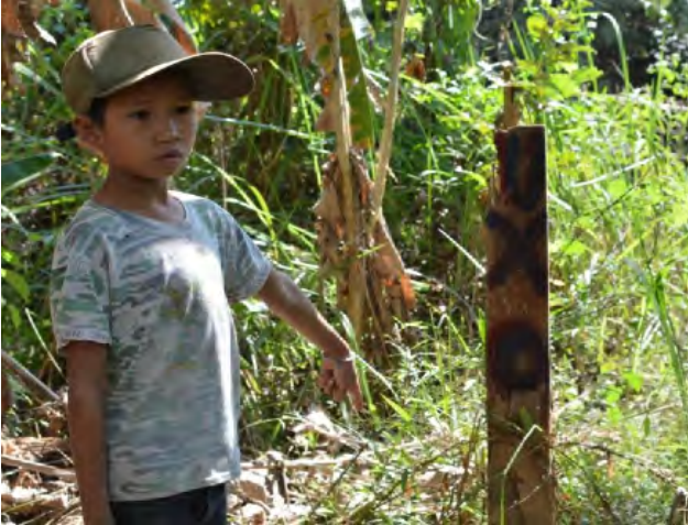
Muangchan village. After RE session, a child reports an UXO he had identified when hunting rats.