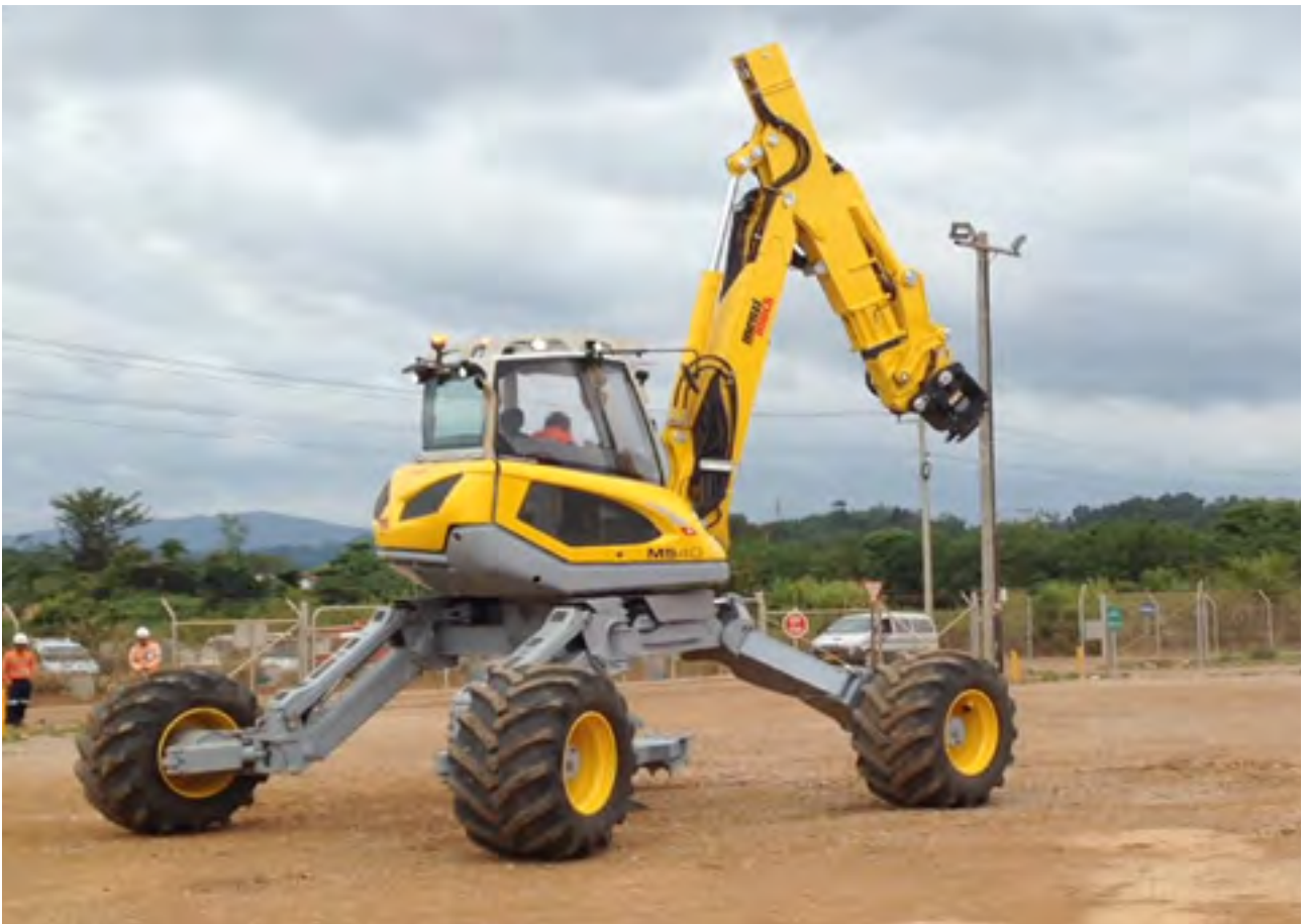
Menzi Muck demonstration in front of MMG-LXML Nalou Gate.