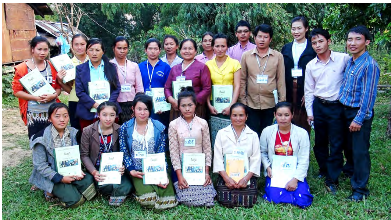
Handicraft training, organized by QLA.