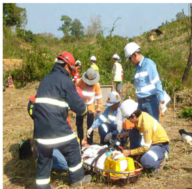
Casualty Evacuation Exercise (CASEVAC) conducted in a UXO clearance site by the Sepon Emergency Response Team (SERT).