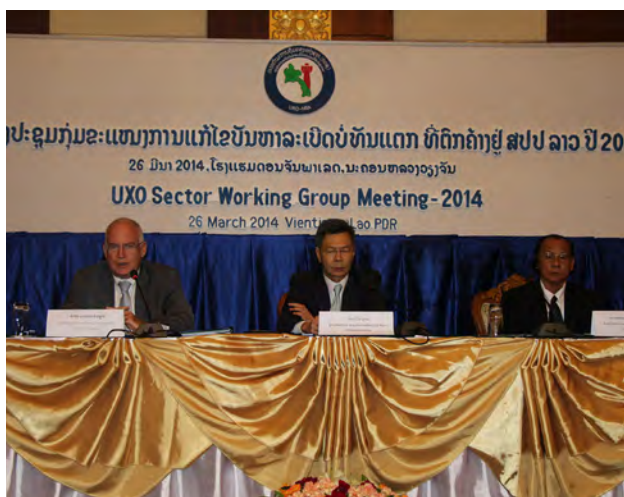
The first UXO Sector Working Group (SWG) for 2014.

On 26-28 August 2014, the NRA organized a workshop on UXO management for provincial authorities across the country. This workshop was attended by the same participants as the first meeting held in January. The aim was to train the person who is in charge for UXO management in their own provinces for better understanding on who is doing what between NRA centre and NRA provincial level. NRA management also highlighted to NRA provincial that the workshop was not aimed at listening to what the NRA centre had done but aimed to encourage provincial authorities to implement the correct role and act as UXO provincial authorities to control and to manage the UXO Sector because provincial staff are more familiar with the local realities in the provinces. In addition, the NRA Office also shared a new draft monthly report for provinces which includes substantive contents needed to be reported to NRA centre, especially, in the area of international staff's working, MRE, VA and Survey and Clearance. After the workshop, some provincial representatives met with NRA centre again for more learning on UXO work planning and budgeting, especially, how to budget for UXO clearance annually for development projects and how money will be used and where it will come from.