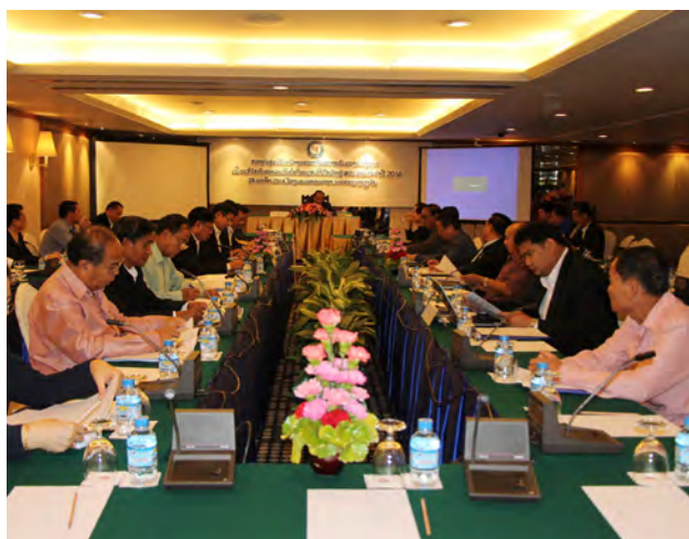
NRA Board Meeting for 2014, at Lao Plaza Hotel.