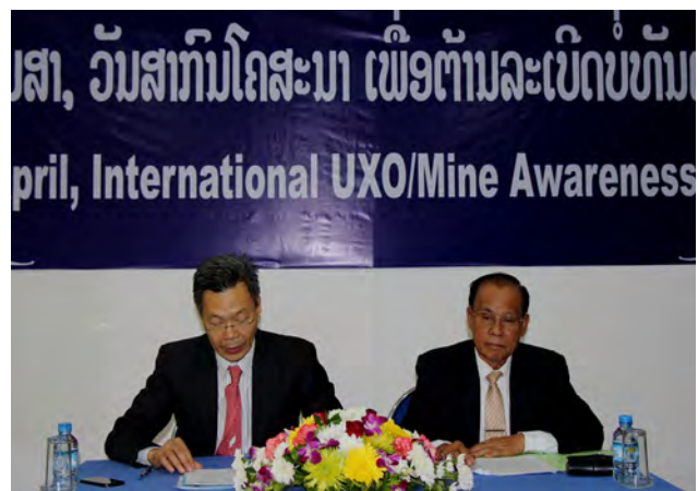
"Press Conference" to celebrate the 2014 International UXO/Mine Awareness Day, 4 th April 2014.

In 2014, 1,000 copies of UXO Sector Annual Report 2013 (500 English and 500 Lao versions) were printed and distributed to line ministries, donors, international organizations and operators. http://www.nra.gov.la/ in the section "Resources".