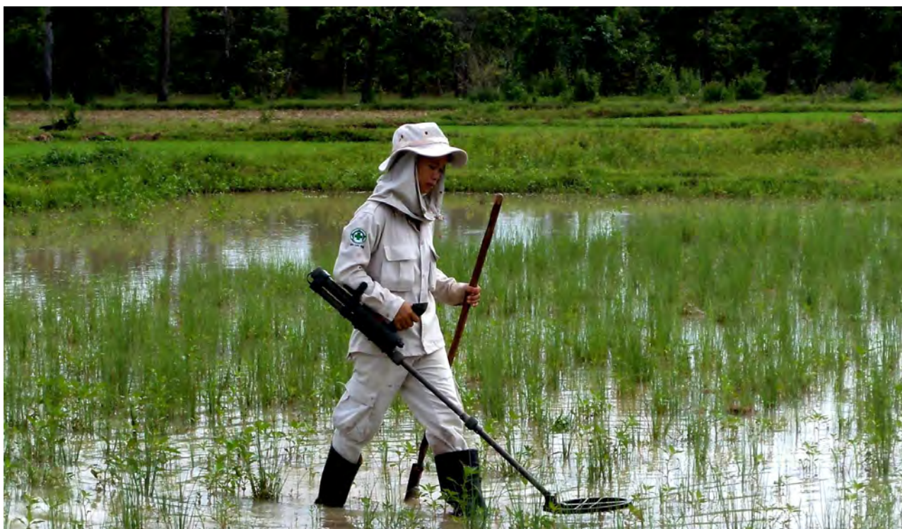
NPA Searcher Doing CMRS In a Rice Paddy Field.