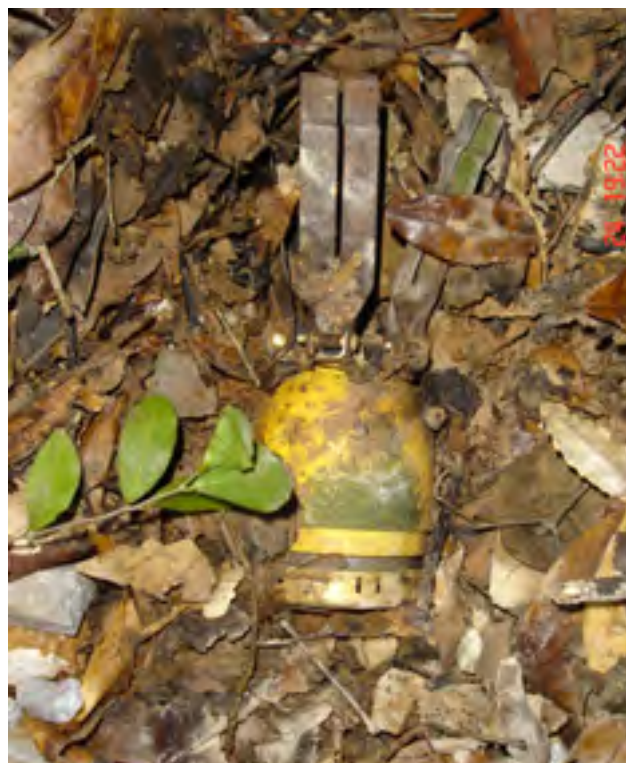
BLU-3B found on the surface.

The Menzi Muck, a state-of-the-art vegetation-cutting machine manufactured in Switzerland, also started its