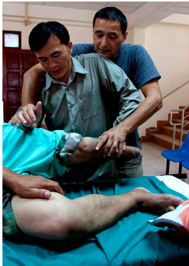
Practical exercises during the COPE-organized gait training course at the Center for Medical Rehabilitation (CMR) in Vientiane.

Furthermore, the COPE Connect outreach project aims to increase awareness and help connect people with needs to the available services. Due to lack of communication technologies, poor road networks, limited or no access to accessible transportation and, significantly, lack of financial resources, people with physical disabilities have been unable to access the CMR/PRC services.