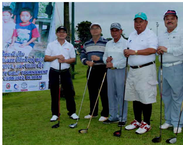
H.E. Mr. Bounyang Vorachith, Vice President of Lao PDR has joined with pleasure.

In 2014, the unit also organized a Charity Golf event to raise funds to support UXO survivors. These activities were attended by a large cross section of Government, UXO operators both humanitarian and commercial and other private sector enterprises.