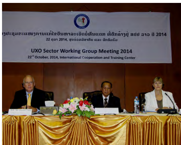
The second UXO Sector Working Group (SWG) for 2014.

On 21 October 2014, the UXO Sector Policy Forum was organized (in addition to 3 TWGs) on Policy, Coordination and Planning. More than 80 stakeholders participated, including Lao Government officials, development partners, UXO operators and technical advisers. Key topics discussed in the meeting included a progress update on data collected for UXO survey and clearance in the focus development areas; a progress update on the trial of the new UXO Contamination Assessment Procedures; the dissemination of the data collected on the needs of UXO survivors, and linkage with