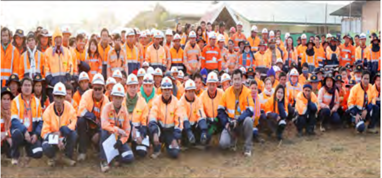
ຕັ້ງຖານທີ່ຂອງການເກັບກູ້ລະເບີດ IN FRONT OF UXO OFFICE