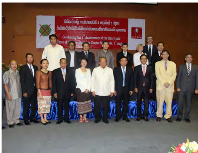
Group photo on the occasion to celebrate the Entry into Force of the Convention on Cluster Munitions (CCM), 1st August 2014, at ICTC.