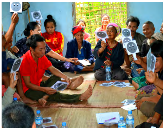
Barrier Assessment Session with persons with disabilities and UXO survivors in Sepone in September, 2014.

In 2014, HI has implemented community-based risk education session (safety briefing in group sessions gender and age-orientated, door-to-door visits and movie events) in 40 villages. It has allowed delivering direct UXO risk education messages to 13,000 beneficiaries, including 45% of women/girls and 53% of children. In addition, HI has developed a partnership with the NRA and the Ministry and Education and Sports for the implementation of school-based risk education activities as part of the national curriculum at primary school level.