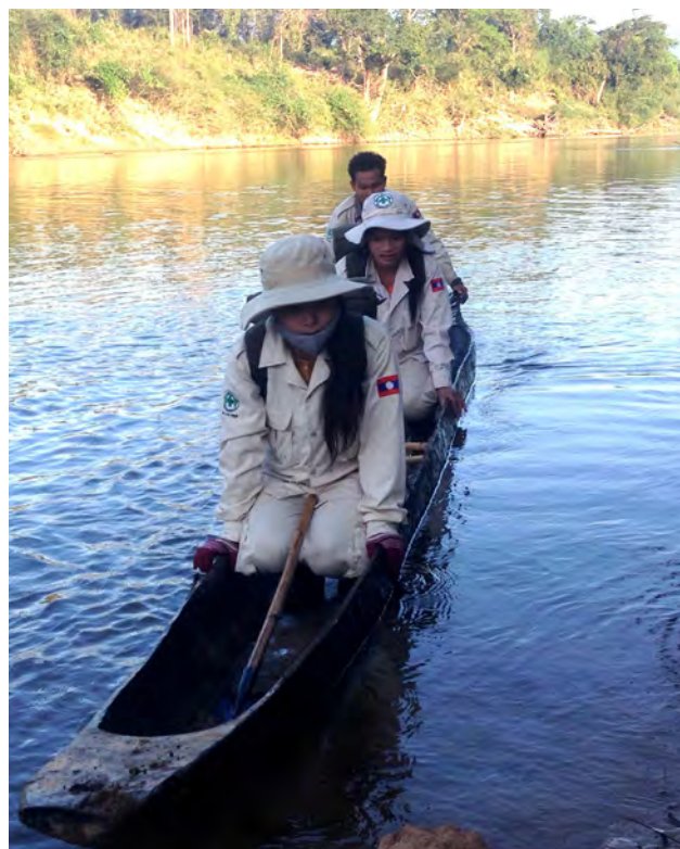
NPA Non-Technical Survey Team.

In the beginning of 2015 NPA will start operations in a fourth province, Xieng Khouang, in cooperation with UXO Lao.