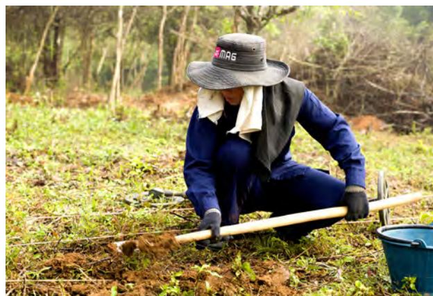
MAG Laos female technician carefully excavating the ground in Xieng Khouang province.

Community Liaison, which MAG pioneered within the UXO sector in the late 90s, is an integral part of MAG's