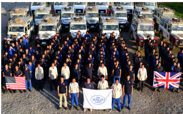
The HALO Laos Programme 2014.

HALO also introduced computer based reporting for technical survey through the innovative use of tablet computers. Using 3G in the field, survey team leaders report technical survey results directly to the HALO data cell, without the need for extra paperwork or lengthy radio calls. This significantly reduces the workload of the IM and the survey teams and is much more accurate than traditional paper based data entry.